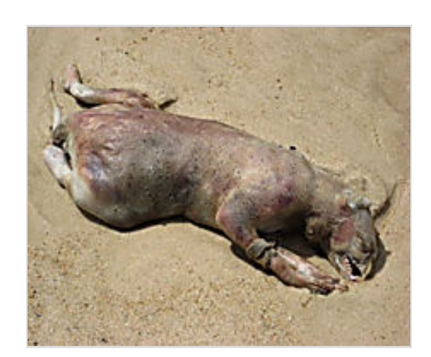
22 Unexplained Creatures Washed Up On The Beach (Animal Mozo)

(Cheap electricity and Gas | UK Energy Supplier | Ovo Energy)