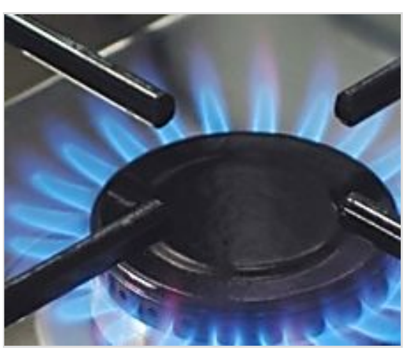
This simple trick could cut your energy bills by £160

(Cheap electricity and Gas | UK Energy Supplier | Ovo Energy)