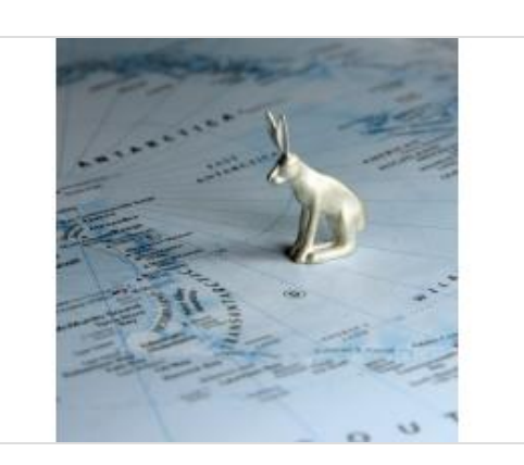
The art of buying prefect presents