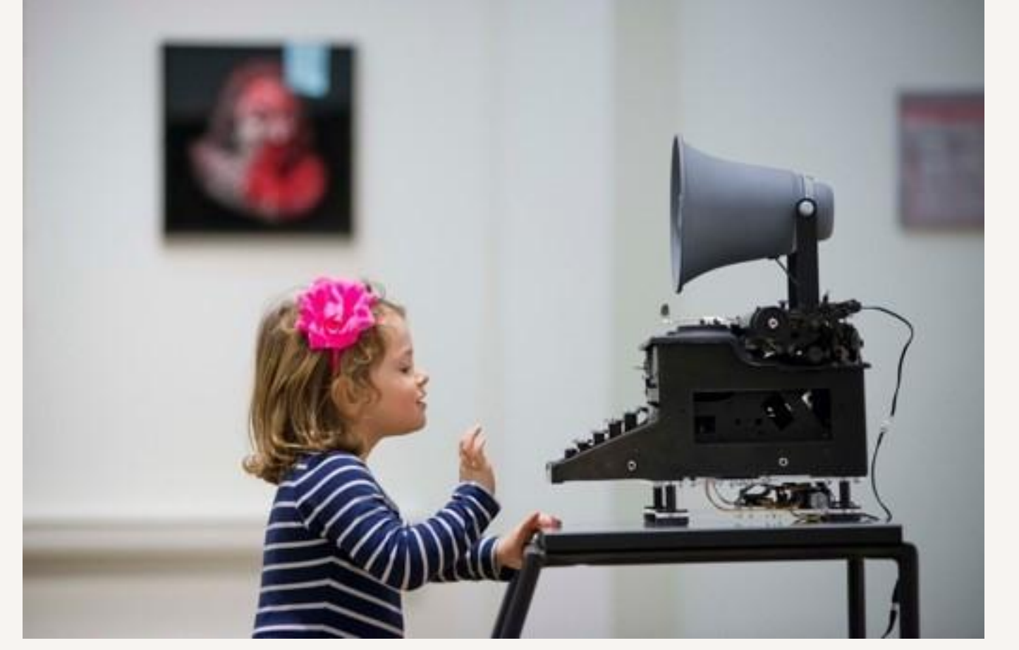
The Society of Scottish Artists 118th Annual Exhibition