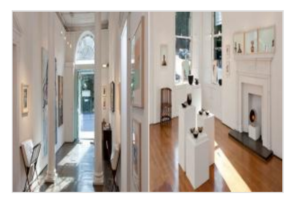
Edinburgh's Open Eye Gallery at 35

St Peter's Seminary reveals its new life, and a new Hinterland at Cardross